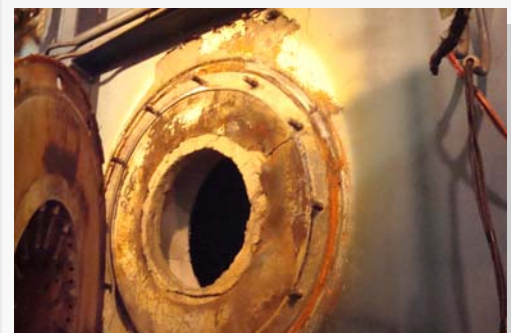
Boiler front wall damage due to refractory failure

Contact us at: info@acsigroup.com to get your copy and a link to the video.